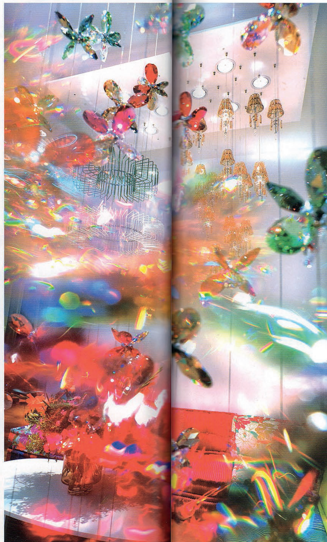
text + photos: Hans Fonk