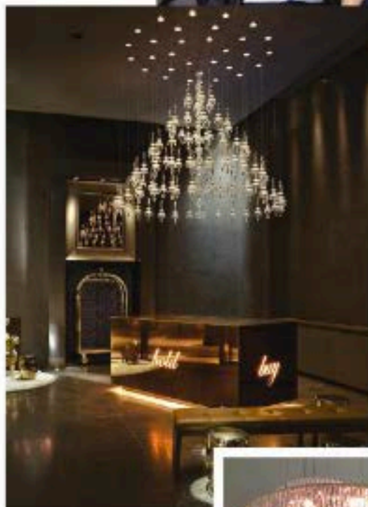
FROM THE TOP: Ligné's dynamic duo Meredith and Yuri Xavier. The Wendell's Balance Chandelier well-stocked at the Modern Group's Dwell 55 on Wall Street. Wendell's Jewel Three Crystal Chandelier, and A bespoke coffee table from The Hyland & Venetian collection.